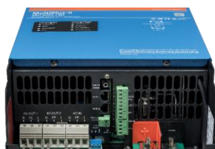
Connection Area MultiPlus-II 4k5